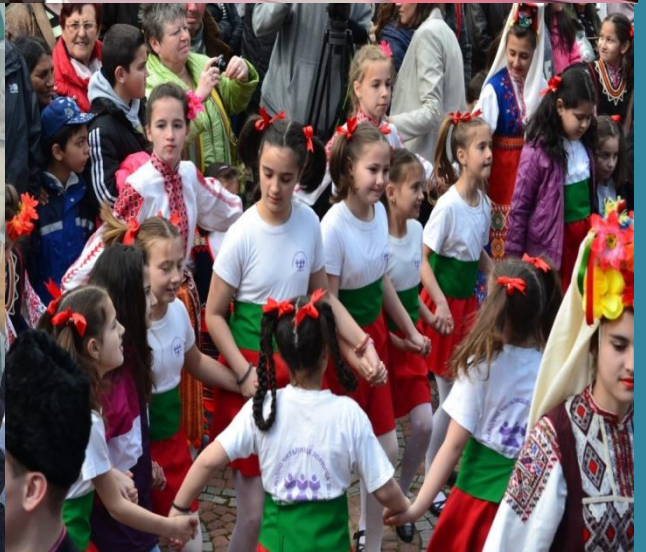
Erasmus + programme