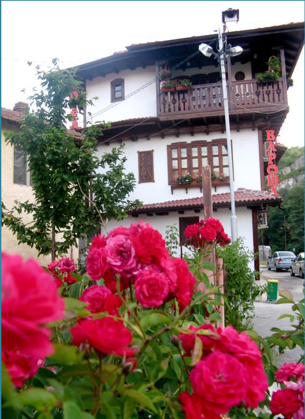
Erasmus + programme