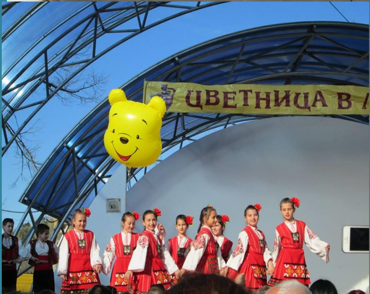
Erasmus + programme